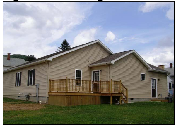
Rear view featuring large deck overlooking backyard