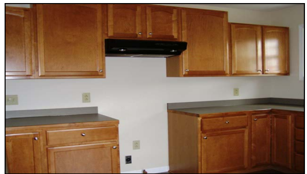
Maple cabinets enhance the open kitchen